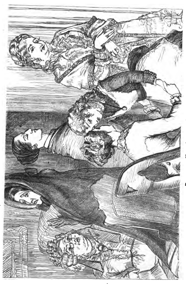
Digitized by Google